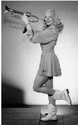
SOS before the operation

This appeased Horatio Hornblower for a moment, every time H Mice paused for breath Vice was in (if Kiwi thought he was a natural at chaos he would only get the bronze medal at the Olympics) There was lots of beer dispensed but very difficult to follow as the Phlegmatic Philharmonic kept jumping in before H Mice could take a lungful of air. The circle was eventually broken up in acrimony (which was odd as we had started in So Kon Po).