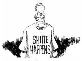
ET 's reaction when told Ice was HM

The pack went berserk questions were asked in parliament and it was decided that the new haberdasher was a Celt. Having thought it through the pack came to the decision that Haggis was a bigger Celt than the HM and thus moved the circle location. Immediately the old hands commented this is going to be as bad as ET 's reign and that ET was probably a big Celt too.