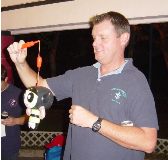
No Nome John is still No Name John