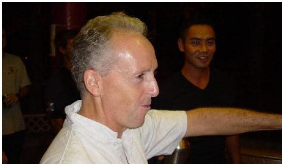
On-In the Hare – SOS