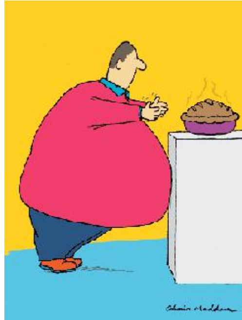
SOS has some dessert