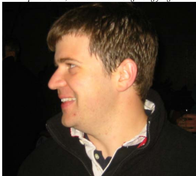
Do you know this Hasher? His kind hasn't been seen since Wales was a world power in 1813.