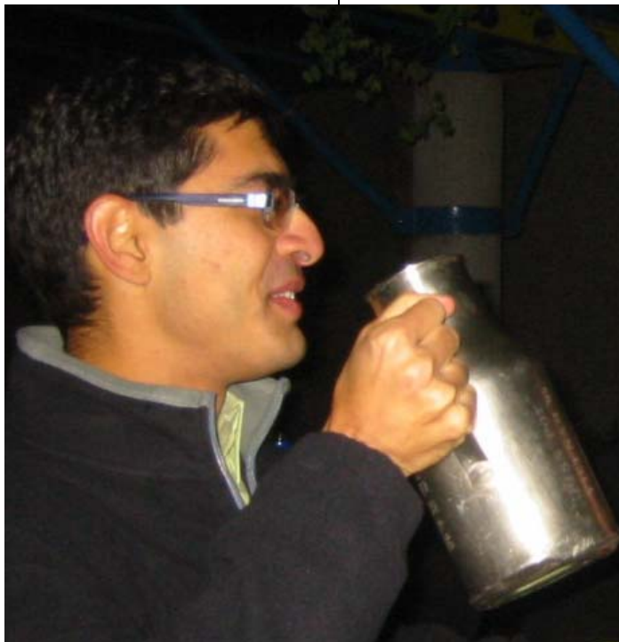
“Special Guest Pesticide puts in a rare appearance”

The notes, the Scribe and the rest of the Circle disintegrated into a drunken, mean, angry stupor at this point.