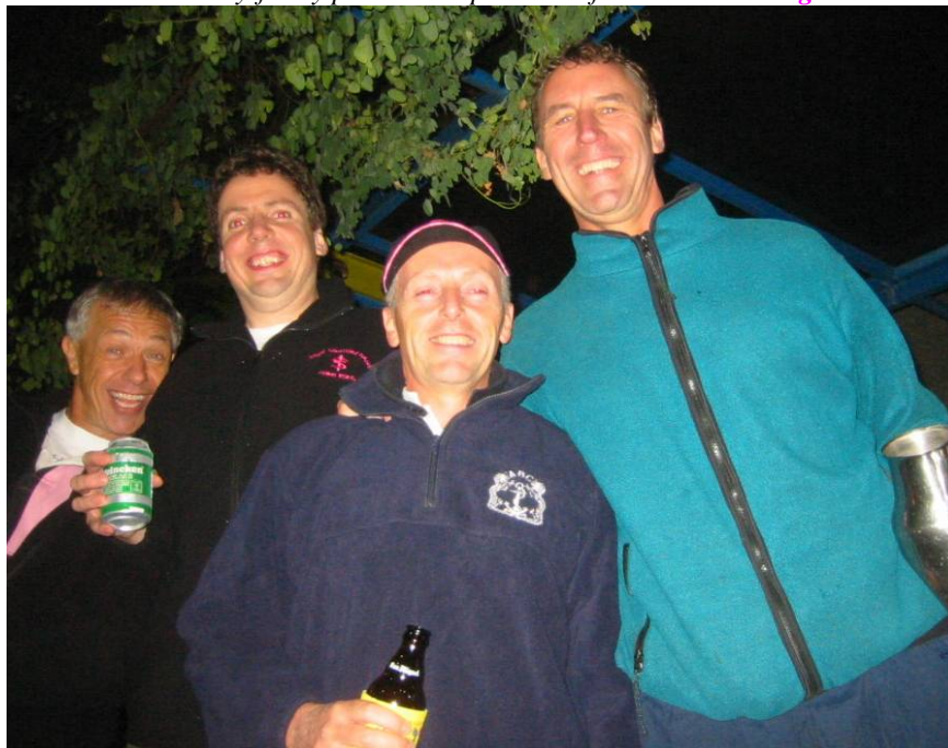
"Last thing the sidewalk sees before you vomit on it"