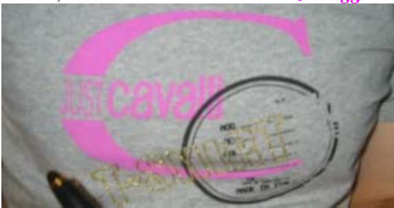
“Cavalli Fashion Power, Baby!”