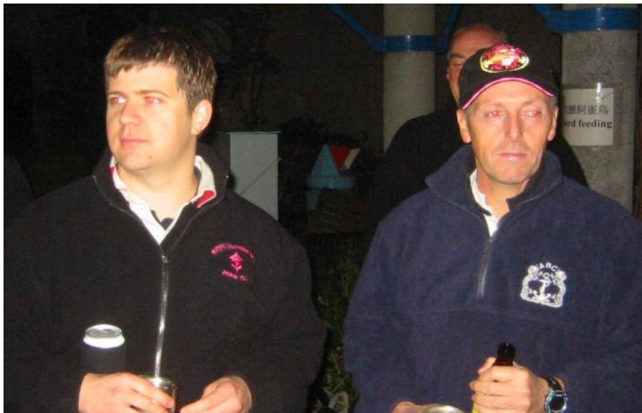
“Warm and Cordial Relations between the HM and VM get things off to a jolly good start”

Coco sets up an ad hoc meal at the always great and sublime Chinese-Thai seafood restaurant. A frozen and ravenous pack sets off for this establishment. A sub-pack clique comprised of Camel , Pugak and E&T splinter off to Wanchai and feast at Ebenezer’s. A drunken Smegma drifts through Wanchai like a ghost. E&T and Pugak are entertained by the usual Camel antics in Boracay. A small subplot of the Camel show is as follows; Camel , “How much?” Bird, “$$$”, Camel , “How much?!?!?!?”.