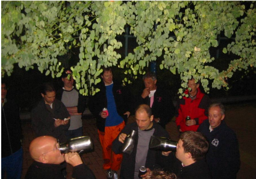
"A real artsy-fartsy picture "