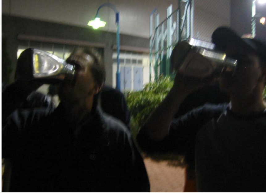
“So much beer, even the camera got drunk.”